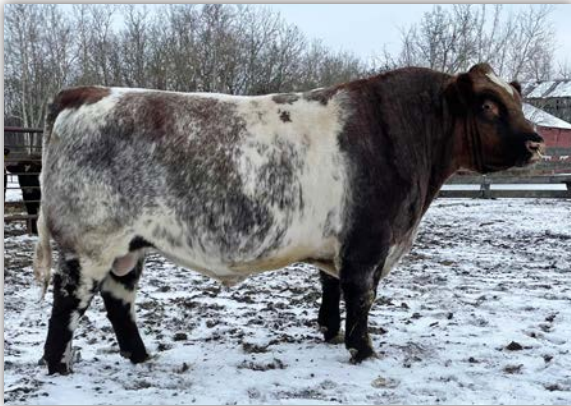
BELL M ZIRCONIUM 53J