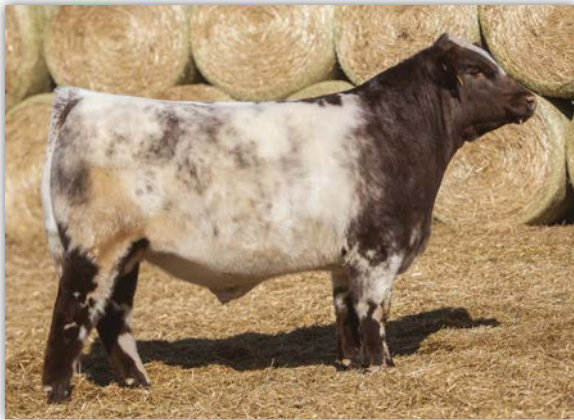
PVF RIVALRY 70K ET