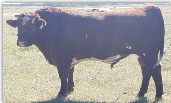
SASKVALLEY FLAGSTAFF 254F