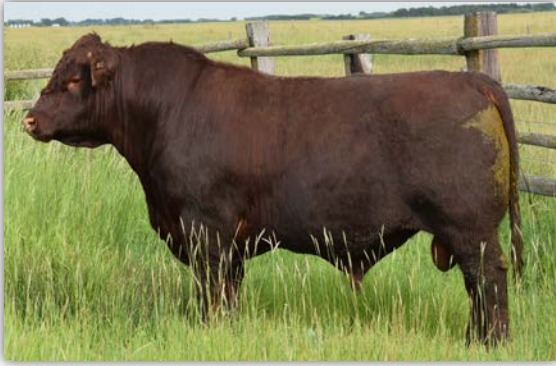
BELL M STOCKMASTER 2K