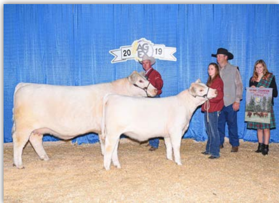
BELL M MARION DELIGHT 48D