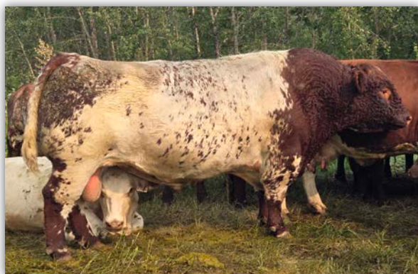
SASKVALLEY GLAM 68G