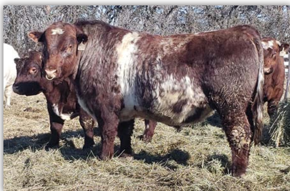
SASKVALLEY JANGLE 220J